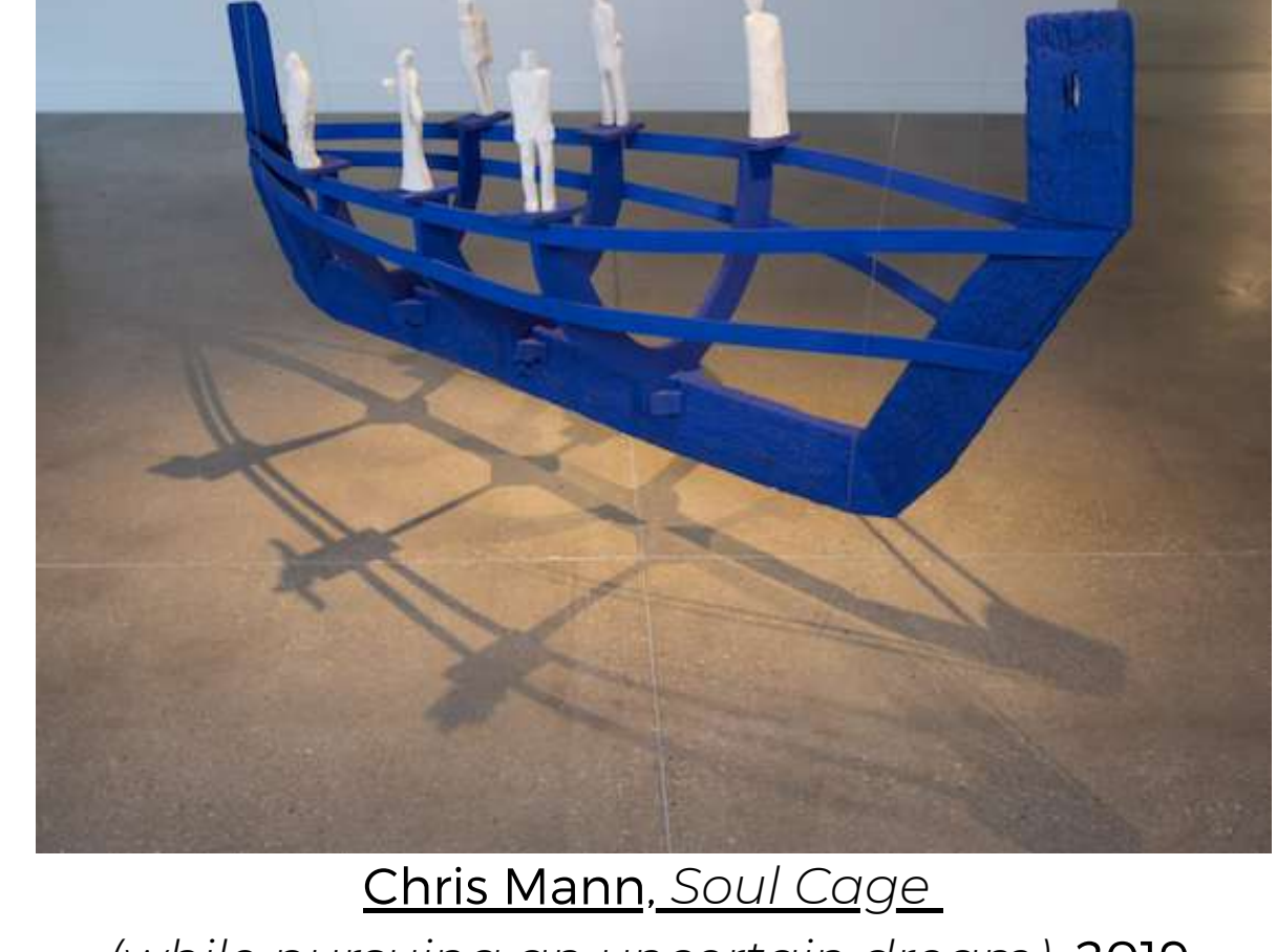
(while pursuing an uncertain dream), 2019.